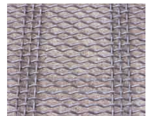
*Triple Wire Slot