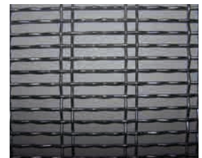
*Double Wire Slot