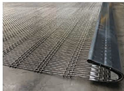
*180 Degree 'C' Hooked Screen

*The above is just some of the specifications we keep in stock.