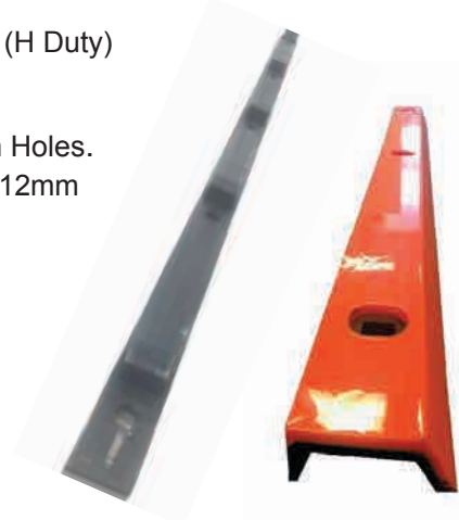
Poly-Coated Clamp Bar & Hold Down Bar